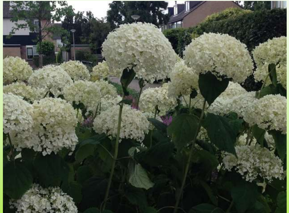
Hydrangea arb. 'ABETWO' Strong Annabelle®