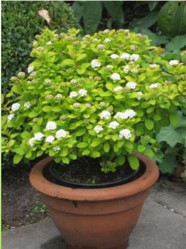
Spiraea bet. 'Tor Gold'