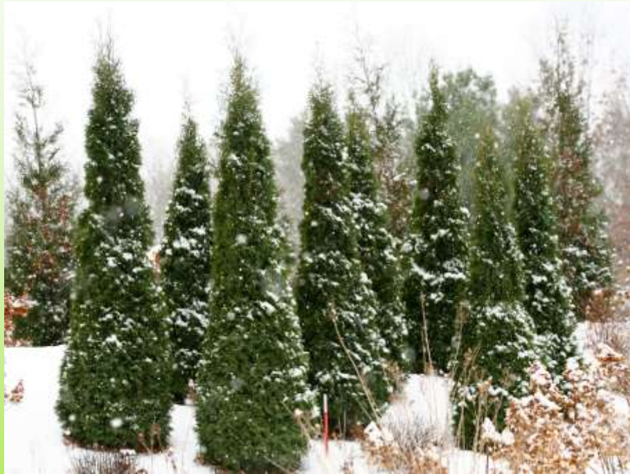
Thuja occ. North Pole