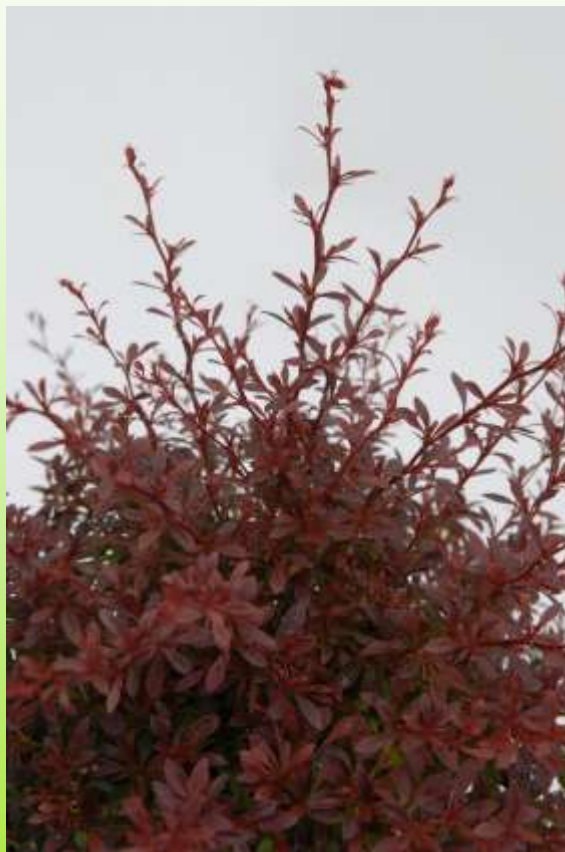
Berberis thun. 'Orange Dream'