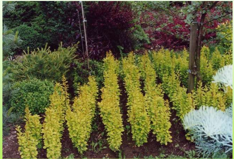
Berberis thun. 'Golden Rocket'