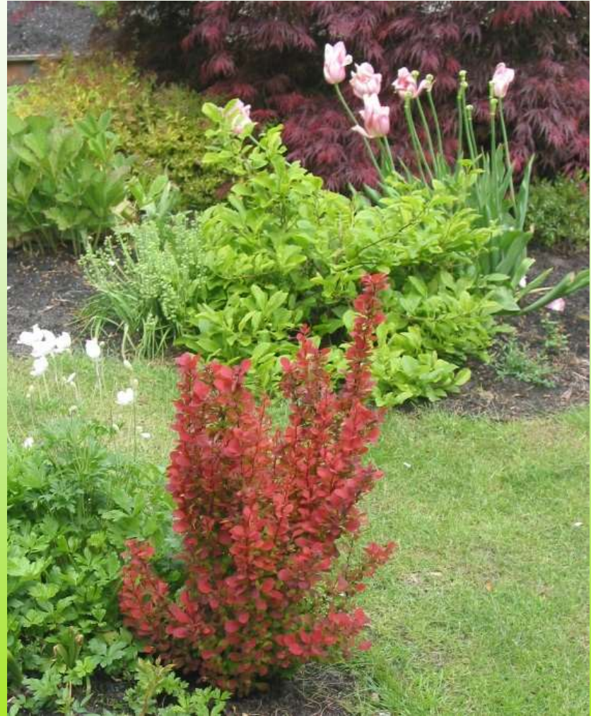
Berberis thun. 'Orange Rocket'