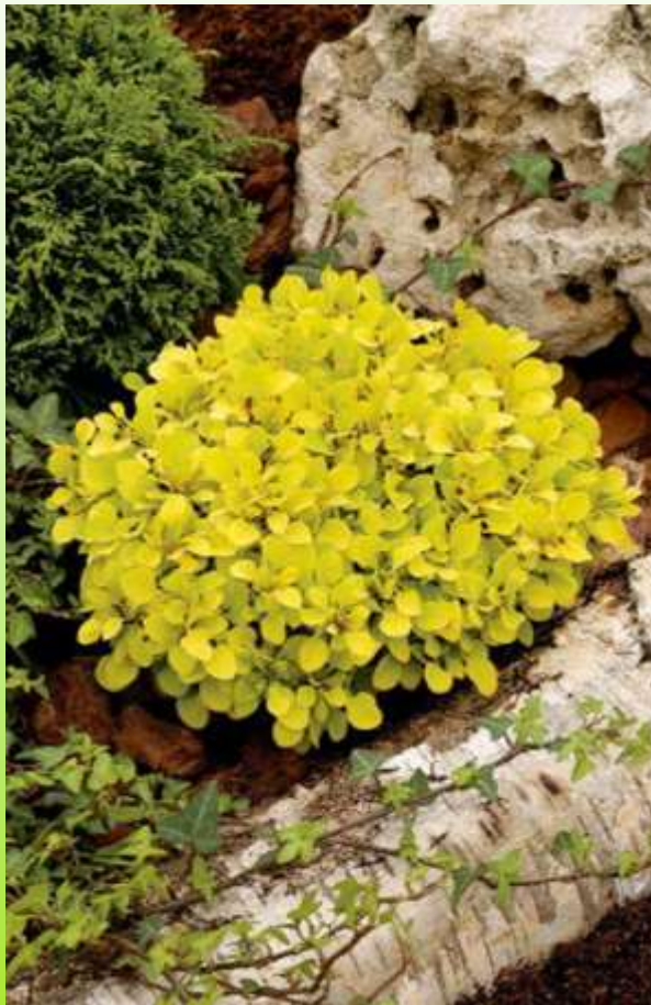
Berberis thunb. 'Tiny Gold'