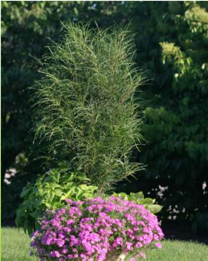
Frangula al. Fine Line®