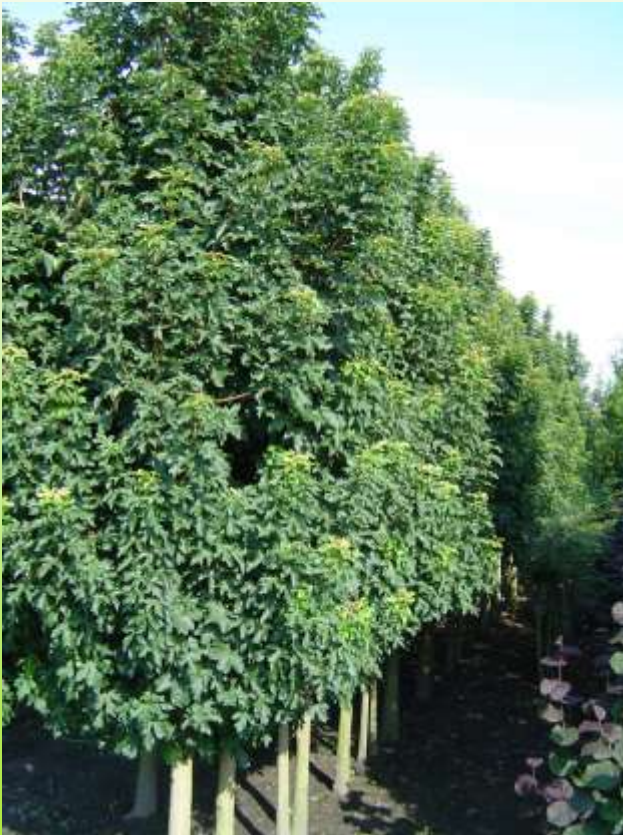
Acer camp. 'Eco Sentry'