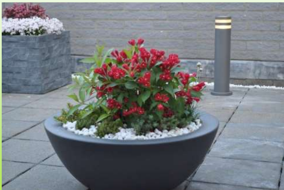
Weigela 'Slinco1' All Summer Red