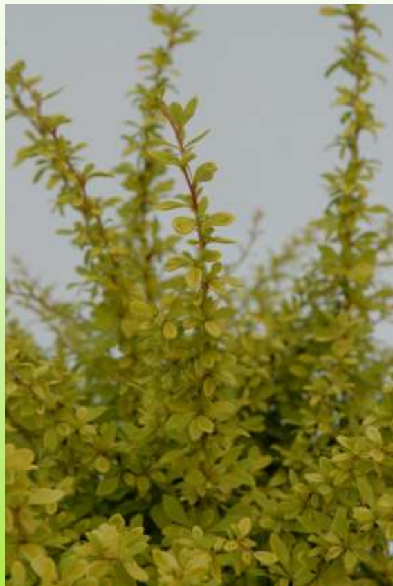
Berberis thun. 'Golden Dream'