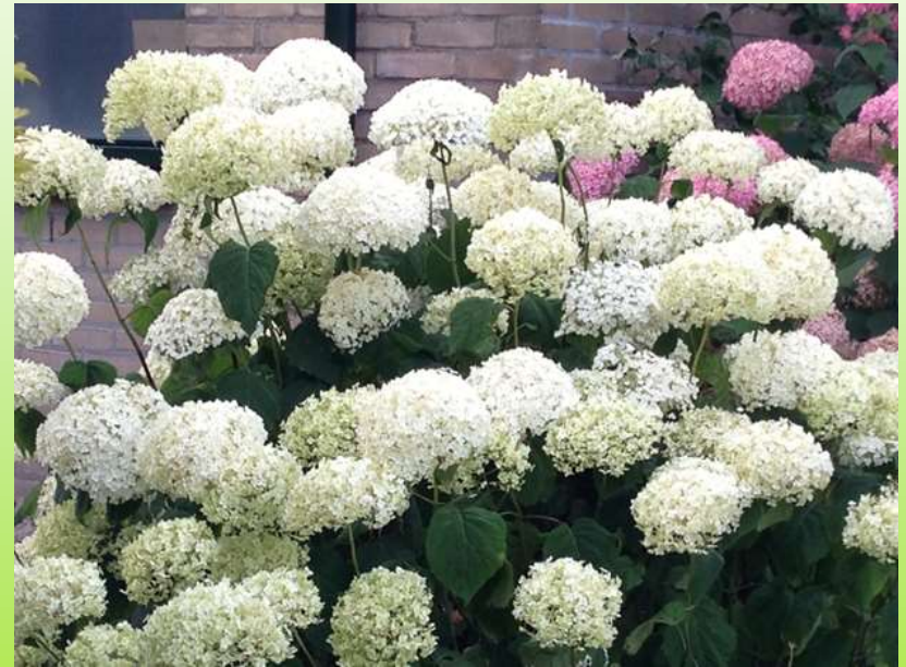
Hydrangea arb. 'ABETWO' Strong Annabelle®