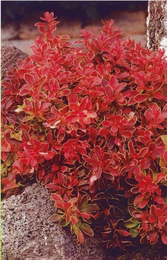
Berberis thun. 'Admiration'