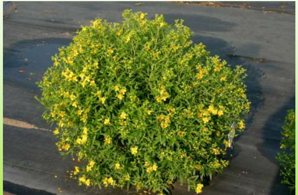
Hypericum kal. 'Deppe' Sunny Boulevard