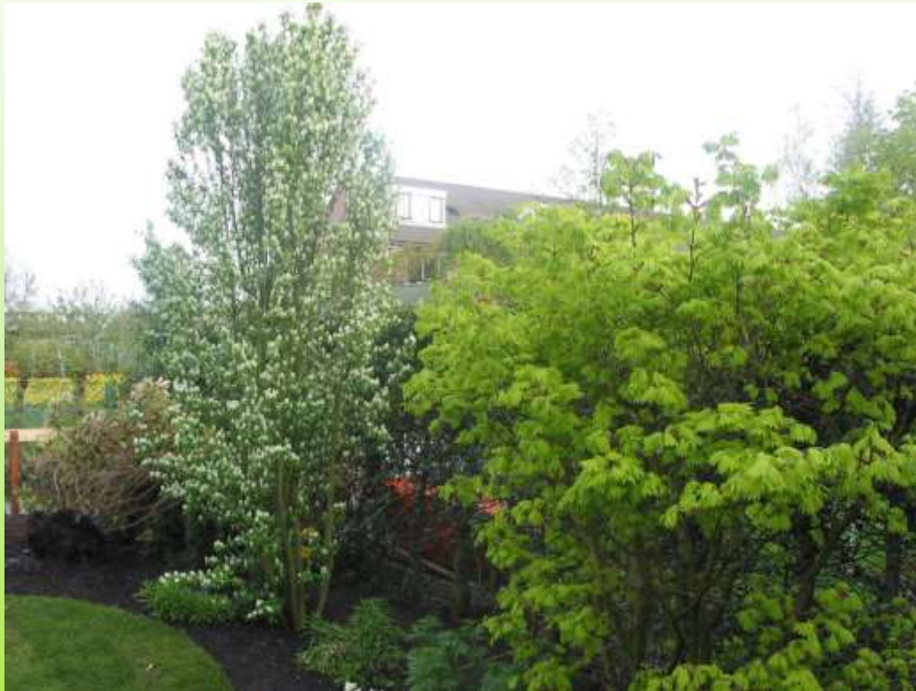
Amelanchier aln. 'Obelisk'