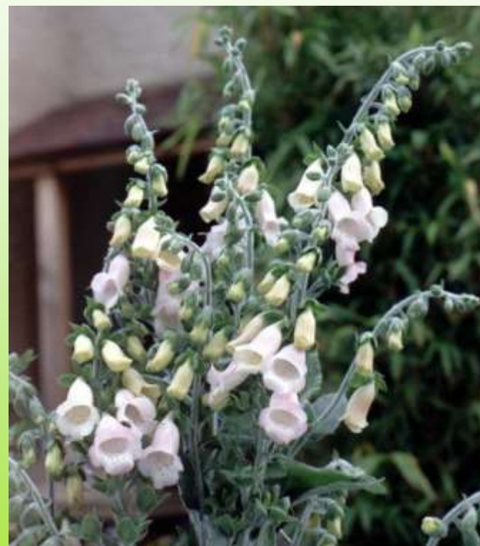
Digitalis 'Silver Anniversary'