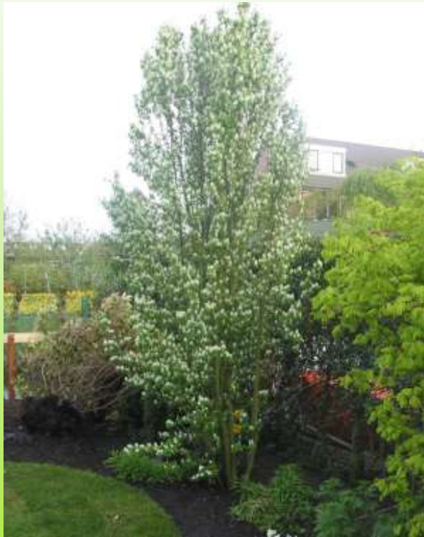
Amelanchier aln. 'Obelisk'