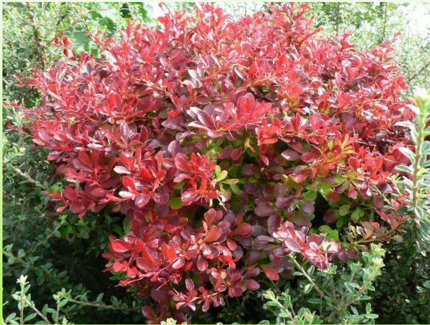
Berberis thun. 'Fireball'