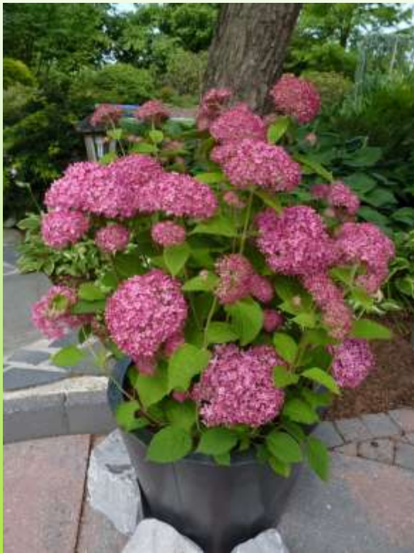
Hydranga arb. 'NCHA1' Pink Annabelle®