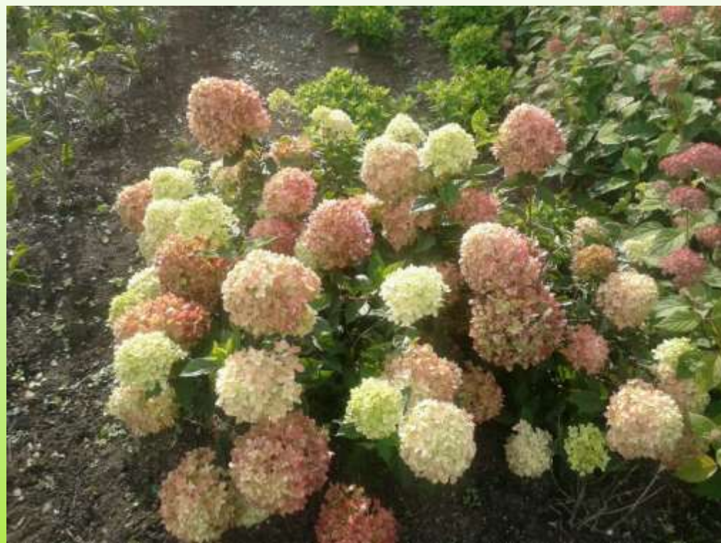
Hydrangea pan. 'Jane' Little Lime®