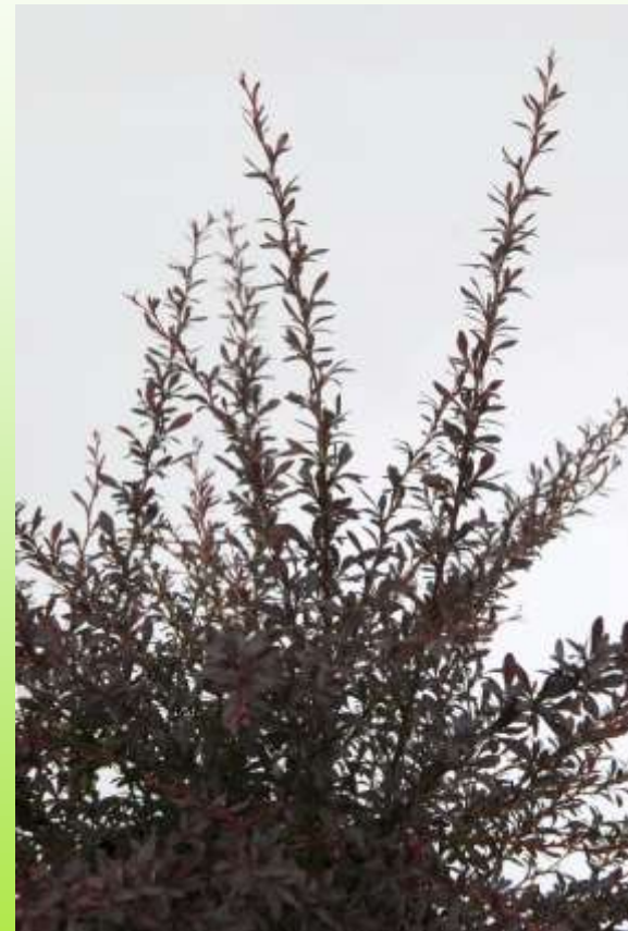
Berberis thun. 'Red Dream'