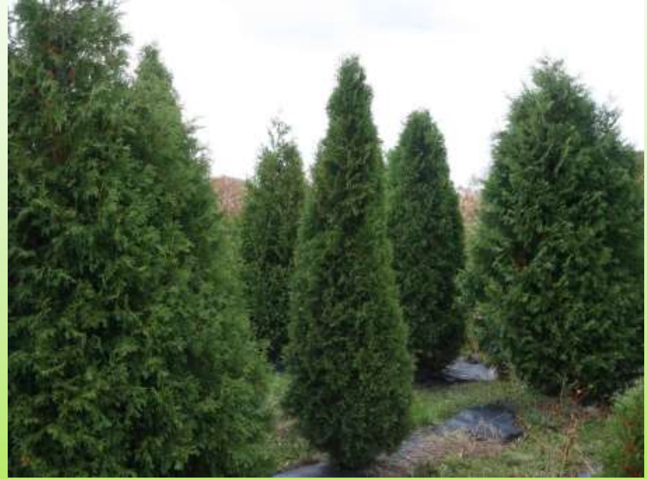
Thuja occ. Skywalker