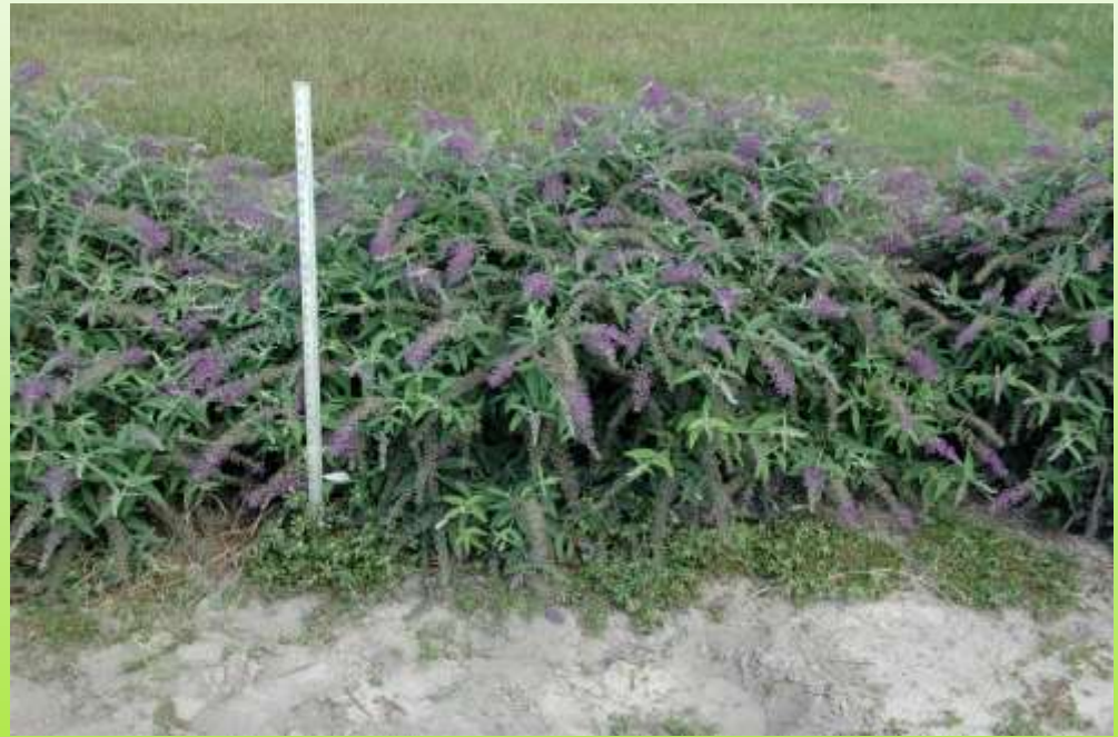
Buddleja Purple Chip