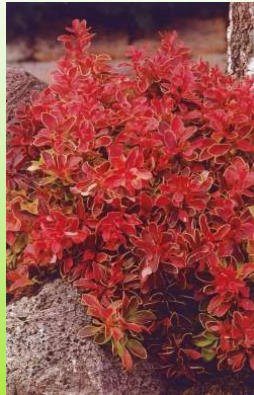
Berberis thunb. 'Admiration'