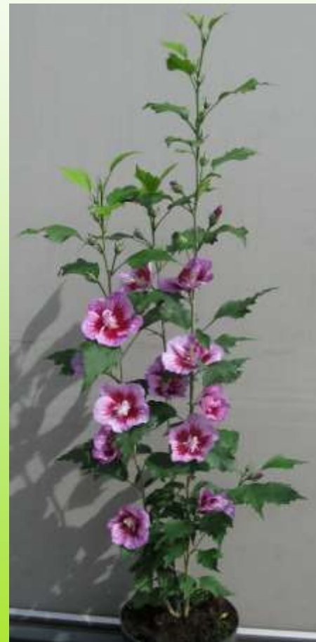
Hibiscus Purple Pillar