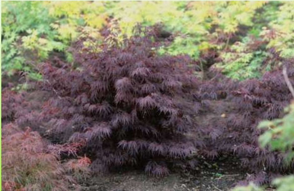
Acer palm. 'Firecracker'