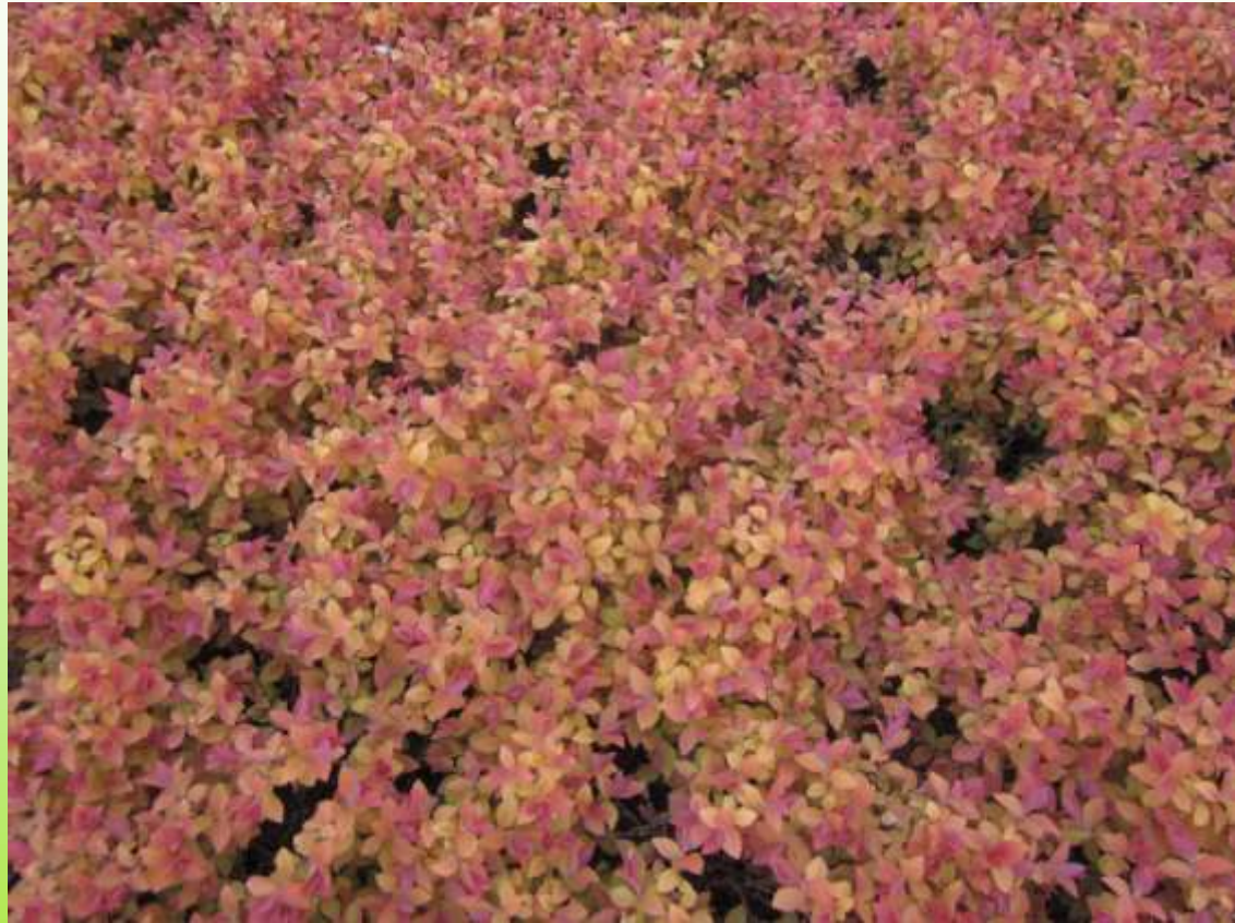
Spiraea x 'Tracy' Double Play® Big Bang