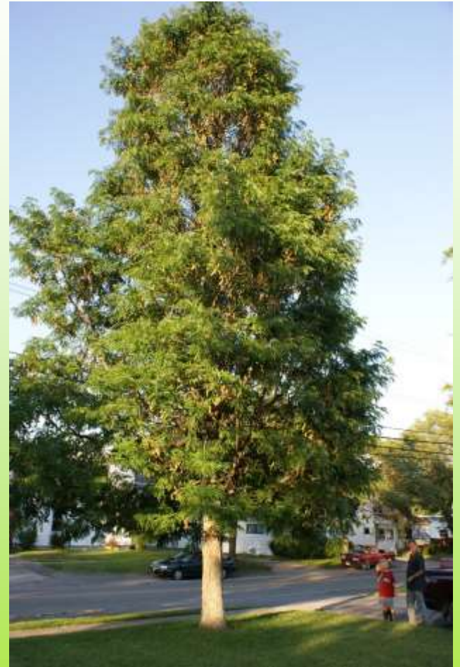
Gleditsia tr. 'Draves' Streetkeeper