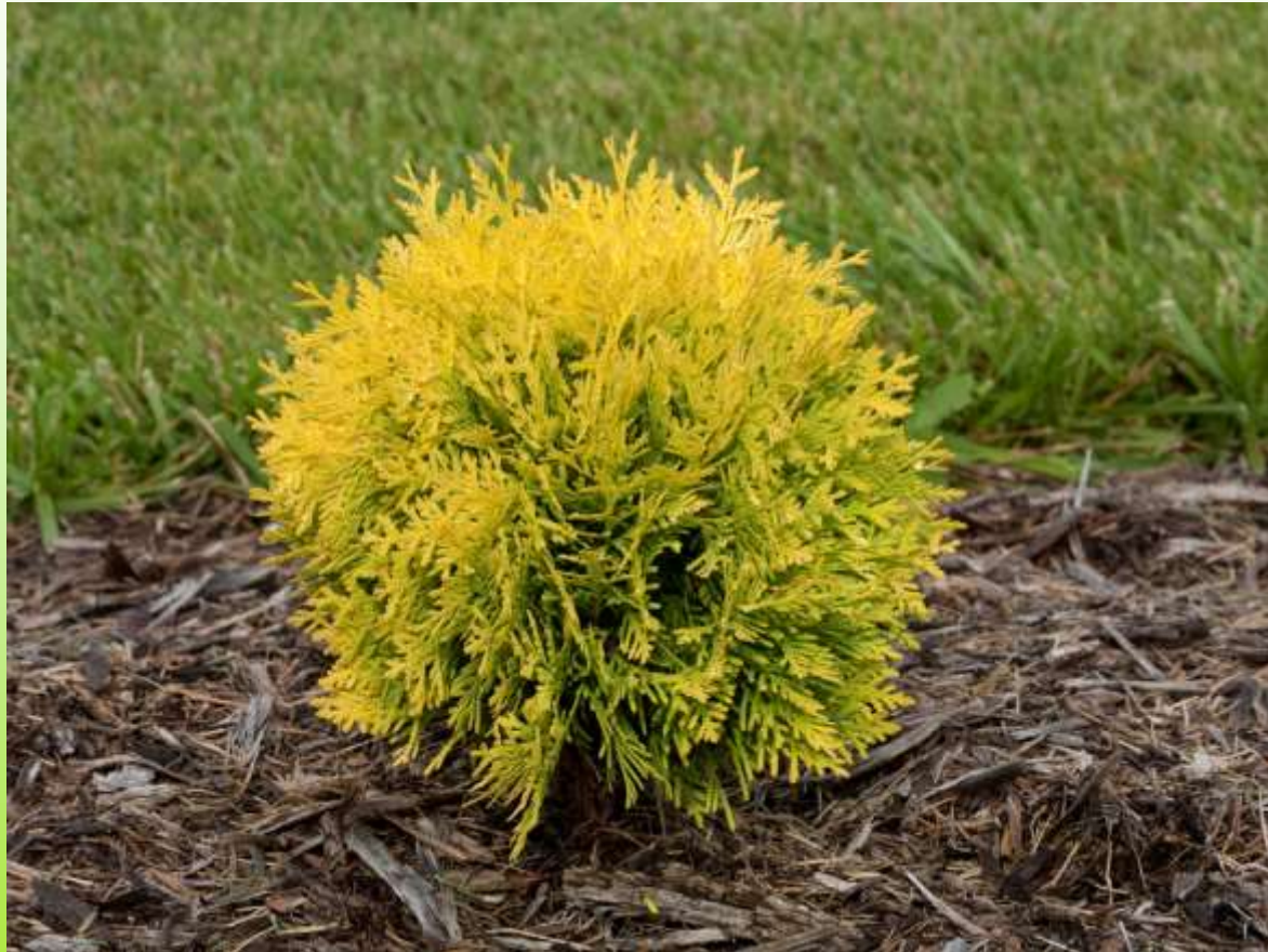
Thuya occ. Anna Magic Ball