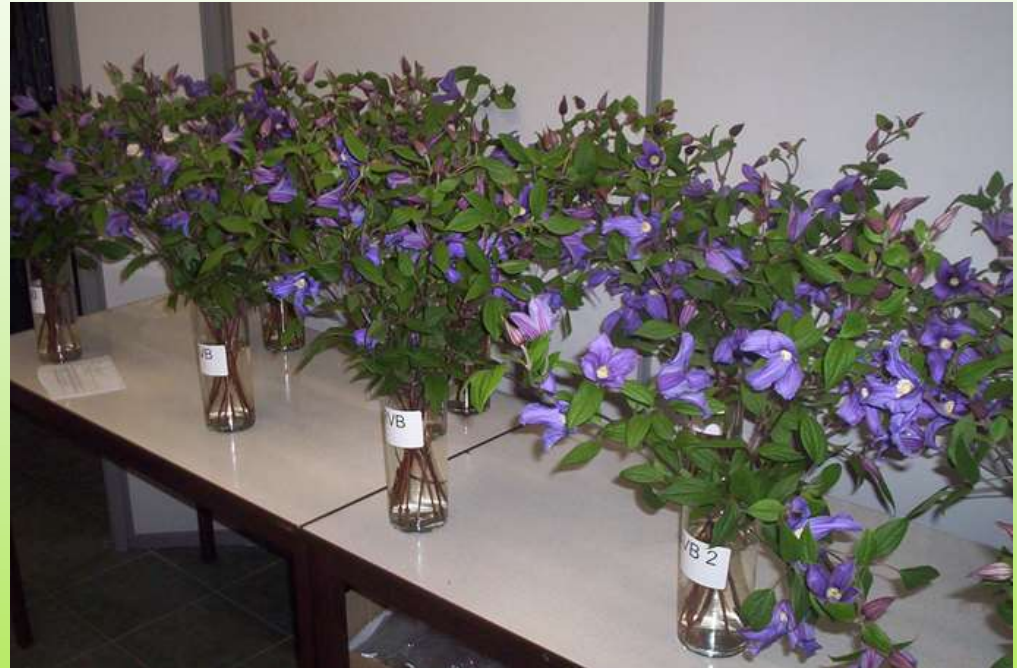
Clematis 'Zobluepi' Blue Pirouette