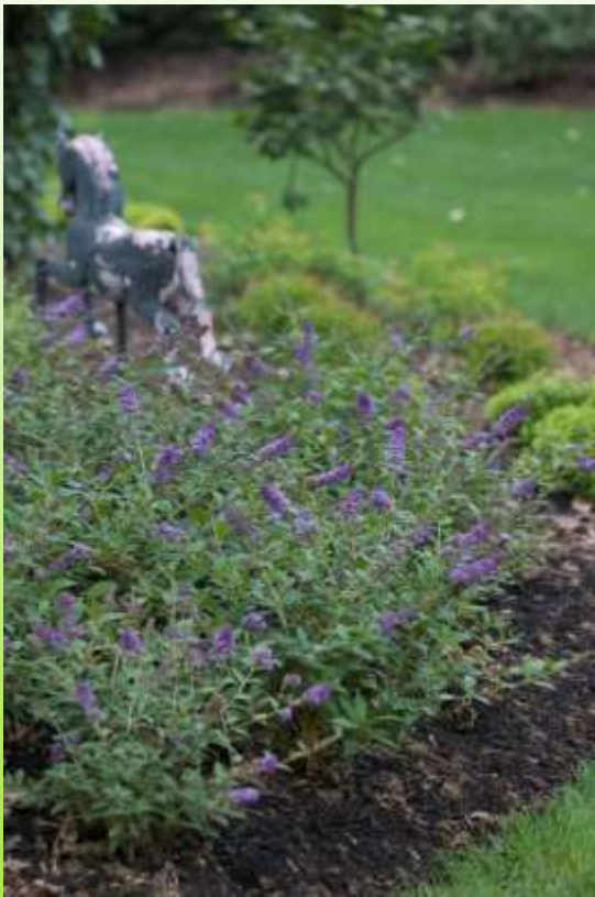
Buddleja Blue Chip