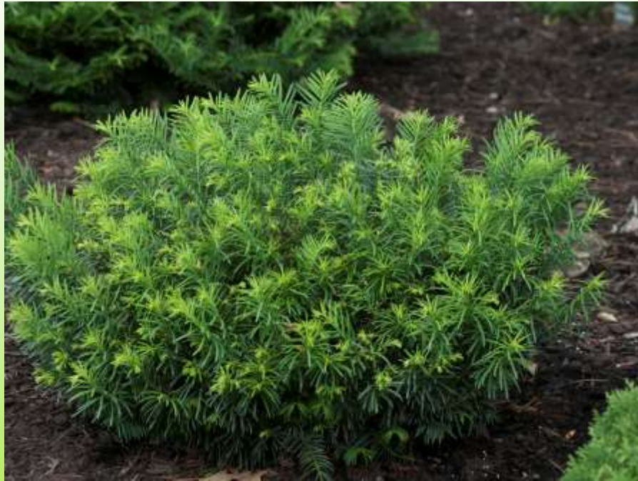
Cephalotaxus Duke Garden