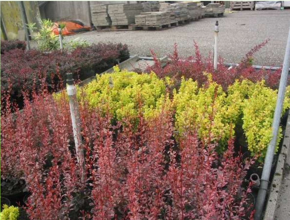
Berberis thun. 'Rosy Rocket'