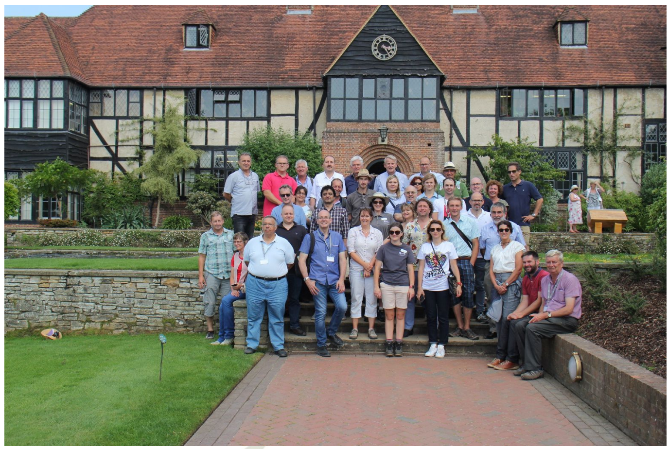
3 The ENA delegates at RHS Wisley Gardens